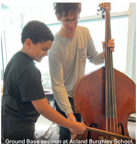
Ground Base session at Acland Burghley School, October 2023