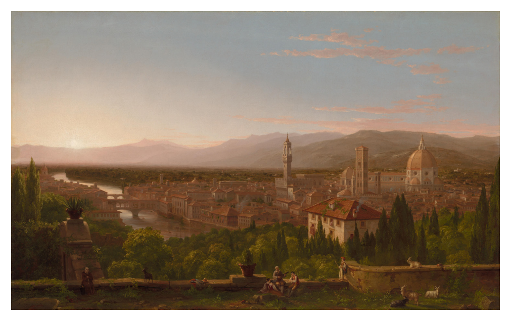
View of Florence, 1837.

passages lead from one movement to the next. The piano concertos are rather economical, perhaps on the short side, but never too short or too long. The G minor has a wonderful opening, very Shakespearean in tone. I think Shakespeare is always in the back of his mind, whether it is A Midsummer Night's Dream or The Tempest."