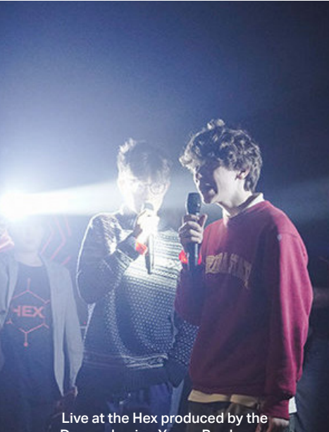
Dreamchasing Young Producers