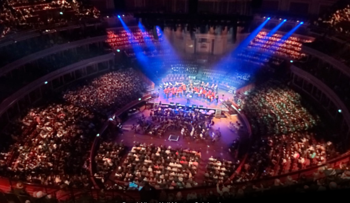
Royal Albert Hall Merton Celebration

"Thank you so much for all your hard work, enthusiasm, music skills and general loveliness with the children. Those who have come in so far absolutely loved it and are totally buzzing this morning!" TEACHER FROM CRICKET GREEN SCHOOL