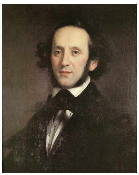
Felix Mendelssohn portrait by Edward Magnus 1846